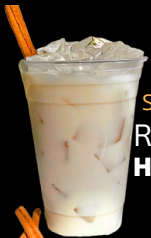
Sat & Sun Rice Milk Horchata