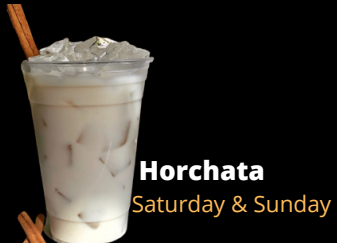
Horchata Saturday & Sunday