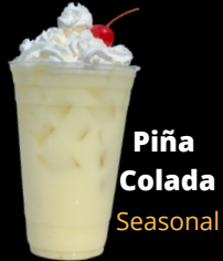
Piña Colada Seasonal

Fresh Fruit Waters all made with REAL FRUIT. We choose a different flavor everyday please check our posts on social media to see the Agua of the day.