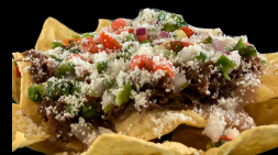
Nachos A plate of tortilla chips with refried beans, cabbage, cotija cheese, pico de gallo