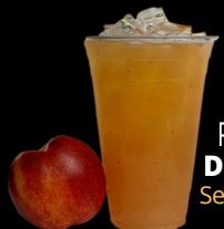
Peach Durazno Seasonal