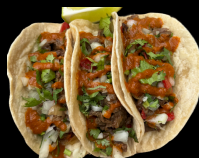
El Taco Árabe Chipotle steak fajita tacos made on a flour tortilla