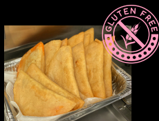
Empanadas de Pollo Fresh corn dough filled with either pollo it is then pan fried and dressed with cabbage, onions, cilantro, and cotija cheese.