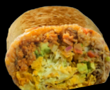
El Burrito Chicano A massive burrito with refried beans, Mexican rice, your choice of meat, cabbage, cotija cheese, avocado, melted cheese, pico de gallo, chips, and our salsa taquera.