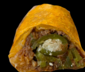
El Burrito Endiabado A spicy XL quesabirria inspired burrito with the flour tortilla dipped into the broth filled with Mexican rice, chorizo beans, birria, rajas (jalapeño & onions), melted cheese, cilantro and a Chile Capone (grilled jalapeño stuffed with queso fresco)