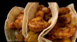
Taco(s) de Camarón Shrimp tacos prepared with sauteed peppers and onions, on a flour tortilla & topped with raw onions and cilantro.