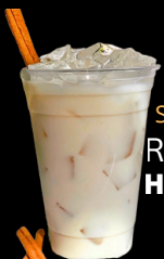
Sat & Sun Rice Milk Horchata