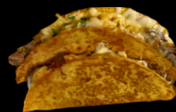
Quesabirria Quesadilla made on a flour tortilla dipped in broth, melted cheese, birria, onions & cilantro. Request Consome if you would like to dip your quesadilla

Request Consome if you would like to dip your tacos